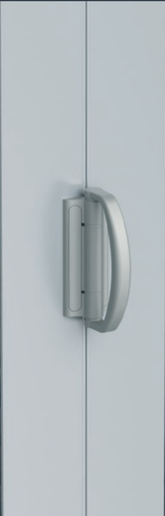
Signature pull handle