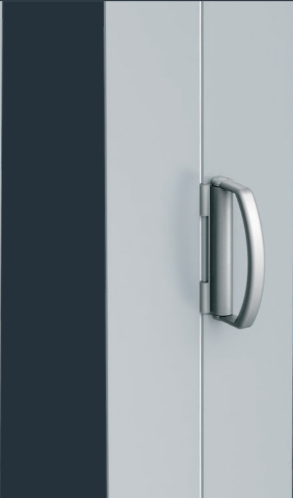
Commercial pull handle