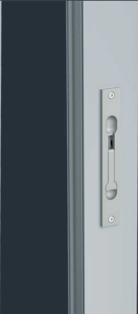
Flush bolt lever