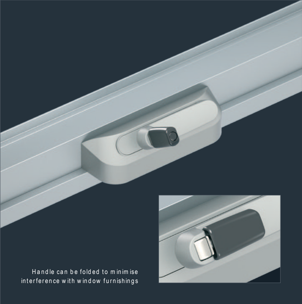
Handle can be folded to minimise interference with window furnishings