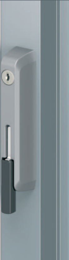
Lever & key operated locking system