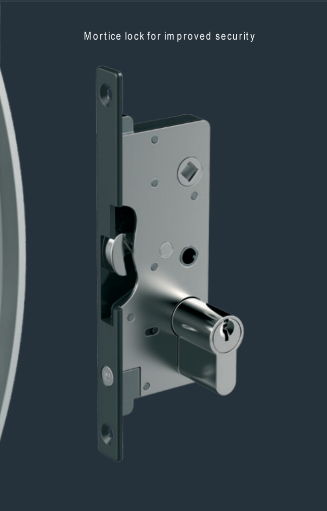
Mortice lock for improved security

Lever conveniently locks the window without a key